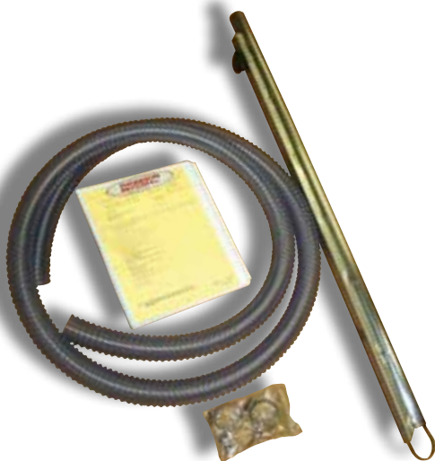
Loader Accessories Kit Included